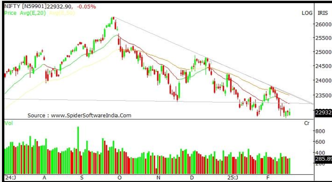
Daily Chart (22,932.90)