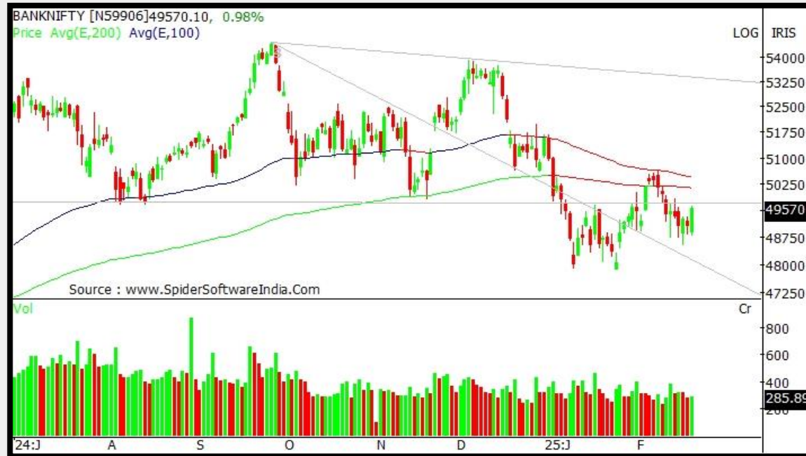
Daily Chart (49,570.10)